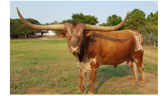
BOOT HEEL 45