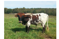
PCC Broken Rock Canyon