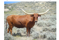
SHEZA TOP MODEL